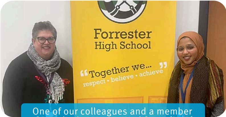
One of our colleagues and a member of Developing Young Workforce (DYW)